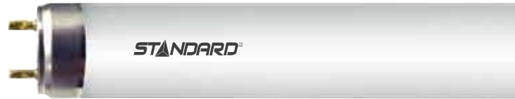
Nominal length : 18 in. (457 mm) Dia. : 1 in. (26 mm)

Order code: 62022 Description: F15T8/CW/PH/G13/STD UPC: 69549620223 Case quantity: 25