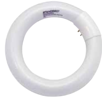
Nominal diameter : 16 in. (406 mm) Dia. : 1 3/16 in. (30 mm)

Order code: 58988 Description: FC16T9/CW/RS/4P/STD UPC: 69549589889 Case quantity: 24