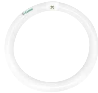
Nominal diameter : 12 in. (305 mm) Dia. : 1 1/2 in. (29.5 mm)

Order code: 56517 Description: FC12T9/CW/RS/4P/ELUME UPC: 69549565173 Case quantity: 24