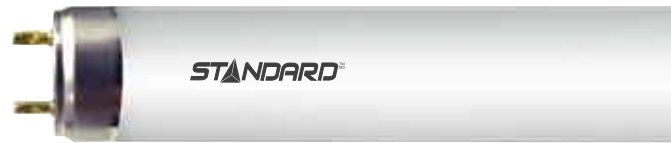
Nominal length : 48 in. (1 219.2 mm) Dia. : 1 ½ in. (38 mm)

Date: _____ In hands date of project: _____ Project name/Number: _____ Name of distributor: _____ Client #: _____ Name of end user: _____